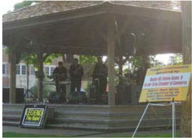
Sponsored by the DHS Alumni Association and the Dexter Area Chamber of Commerce , LEGEND The Band played for those gathered in the park on a beautiful June evening.