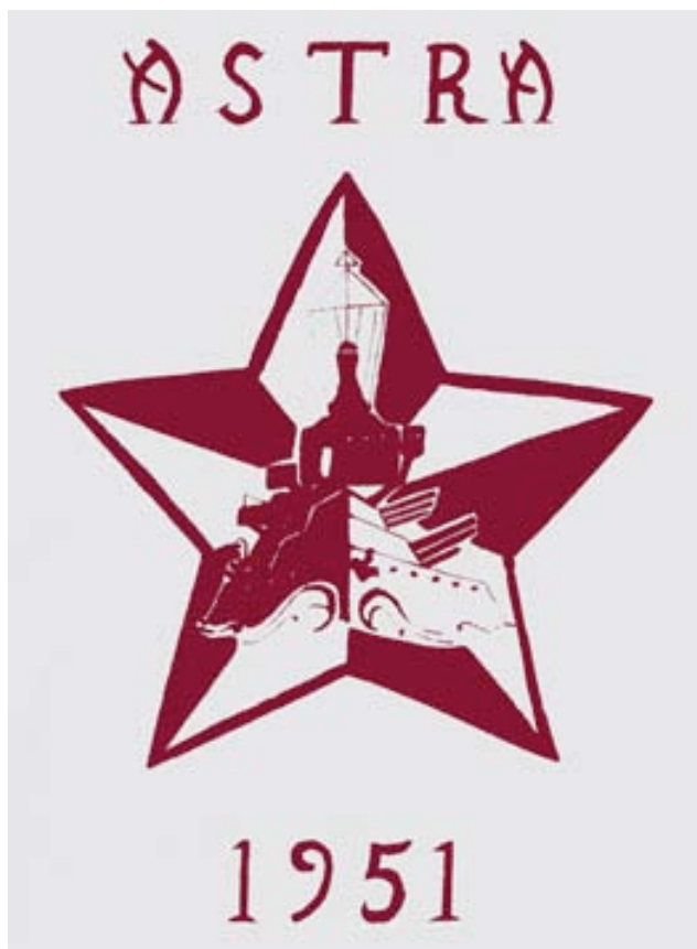
Cover of 1951 DHS Yearbook

DEXTER HIGH SCHOOL ALUMNI ASSOCIATION PO Box 83 Dexter MI 48130