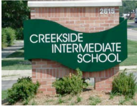
Former High School on Baker Road